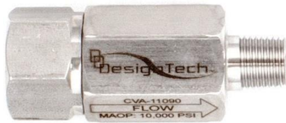
CVA 11090 1/4" 10K Check Valve Assembly