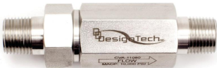
CVA 11080 1/2" 10K Check Valve Assembly

The CVA-11000 Check Valve Assembly is designed as an inline high pressure check valve for surface and subsurface environments.